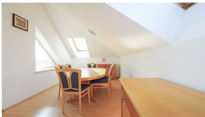
table. The balcony is oriented to a quiet inner courtyard. The rent includes high-speed internet access.